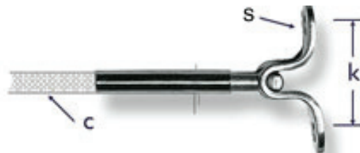
Handy Crimp Deck Toggles